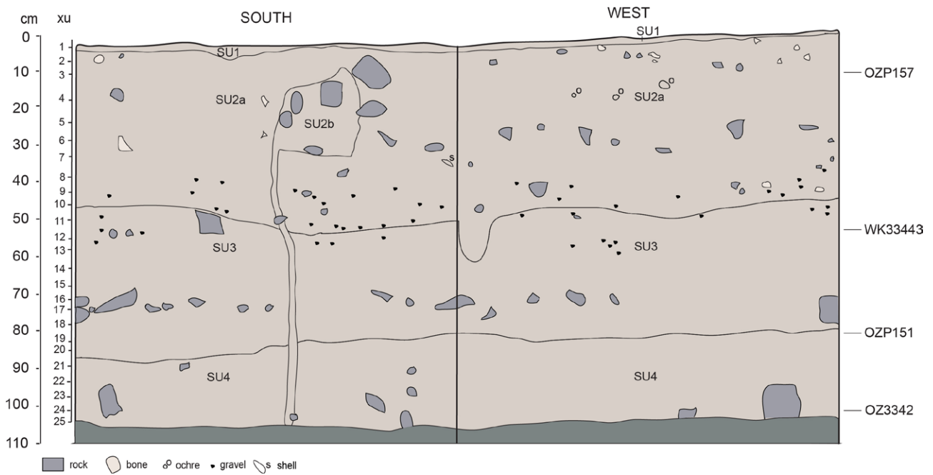
Figure 2 Stratigraphic drawing of Square B.